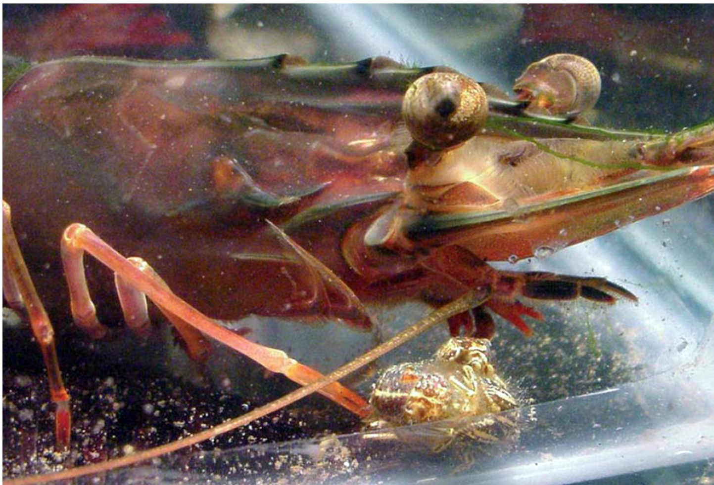
Penaeus monodon broodstock feeding on hermit crabs.

In Vietnam, hatchery operators have used live hermit crabs to feed Penaeus monodon broodstock since around 1993. These anomuran crabs can be found in large numbers in rock pools along rocky shores or on sandy seagrass beds. Crabs are physically removed undamaged from their borrowed shells, which requires some skill. When large numbers of crabs are needed, the shells are broken and immersed in a seawater basin, where the crabs will crawl out of their damaged shells and can be easily collected. The “naked” crabs are then placed in maturation tanks for shrimp broodstock to feed on. On average, a healthy broodstock shrimp can consume 8 to 10 hermit crabs a day. The proportion of fatty acids of the omega-3 and omega-6 families in maturation diets has attracted much research interest. Here I discuss the use of hermit crabs and the fatty acid profile of hermit crabs collected locally in southeast Queensland, Australia.