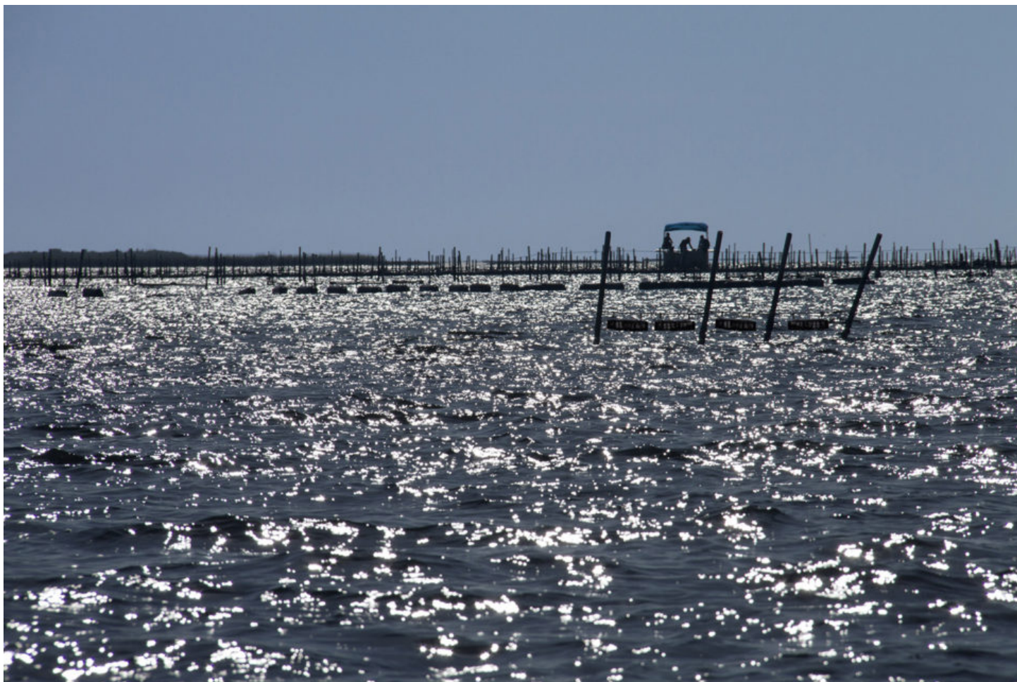
Apalachicola Bay could be home to the first oyster hatchery in Florida.