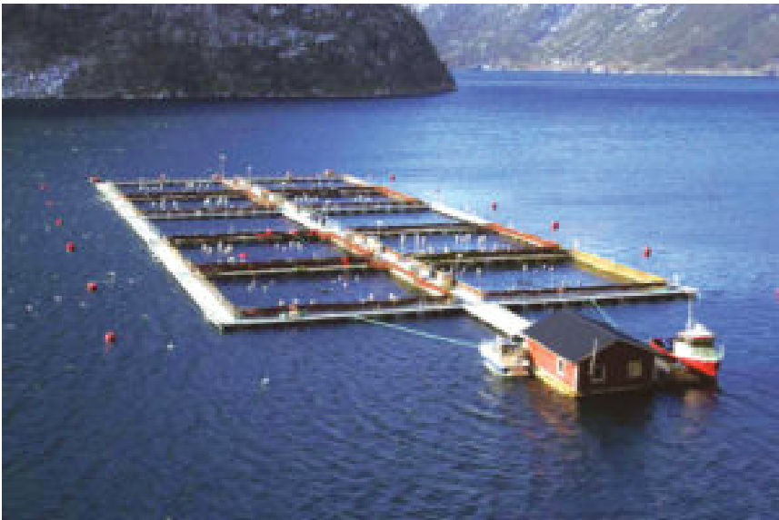
Halibut grow-out takes place in sea cages or land-based tanks.

Although the challenges of diseases seem to be under control, a stable production of viable juveniles with the correct shape, pigmentation, and morphology is the main issue for the future. In the grow-out phase, the industry has limited knowledge of fish health concerns, water quality, nutritional needs, and problems with early maturation in males.