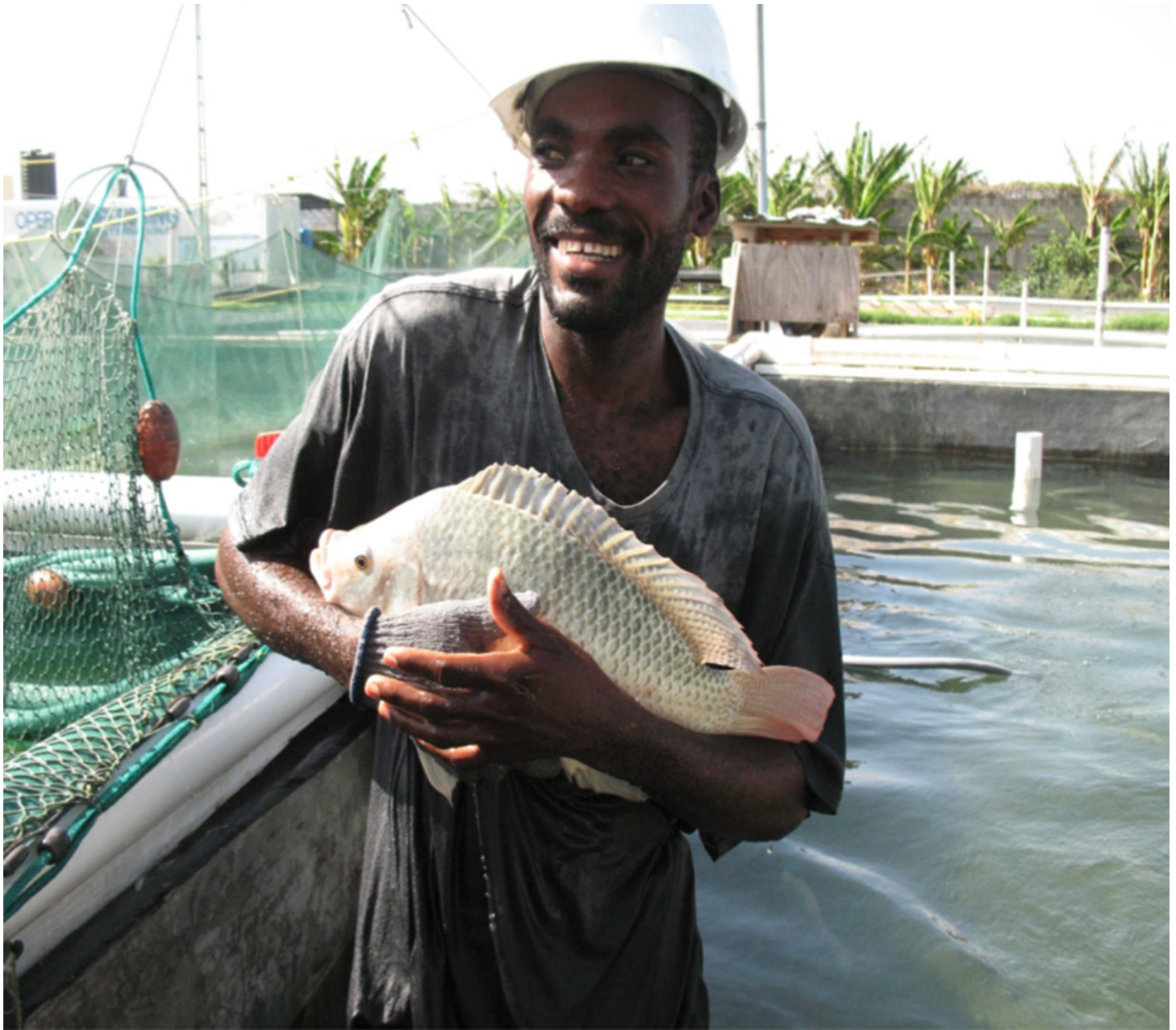
A worker at a tilapia hatchery near Port-au-Prince, Haiti, holds a broodstock fish.

Why in the hell is there no aquaculture on this island?