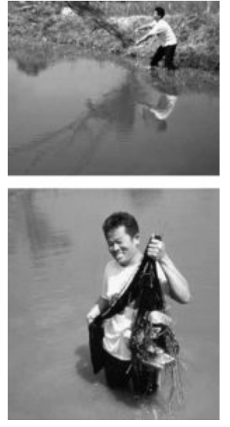
Sampling tilapia in a green water pond