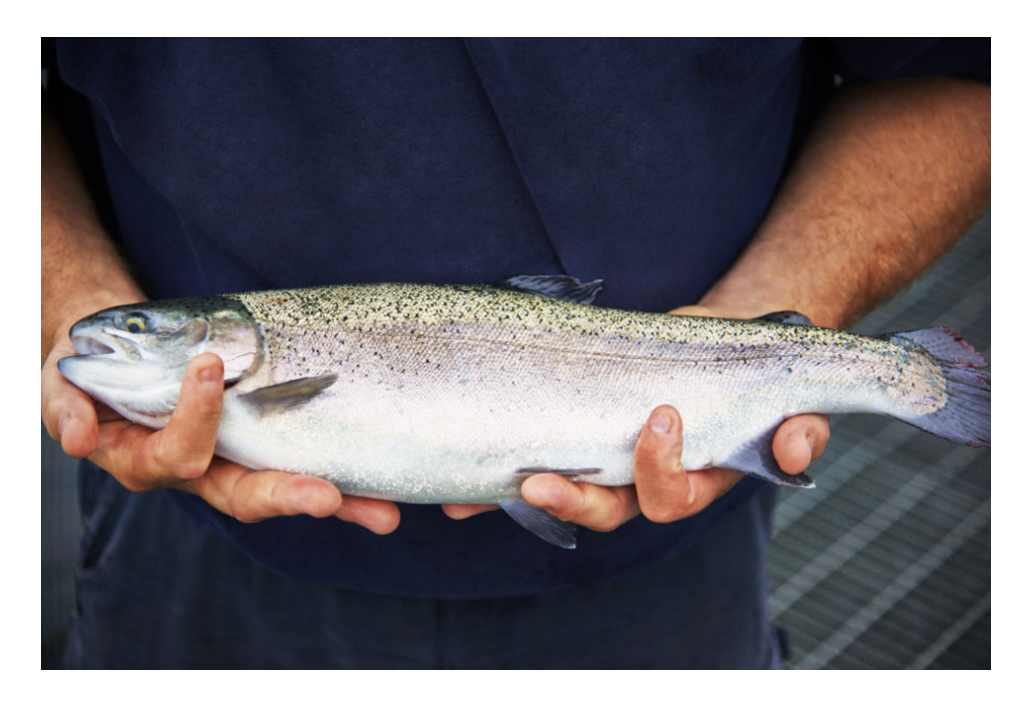
A farmed trout raised by Blue Goose Fish Farm in Manitoulin Island, Ontario.

Canada and the United States may be neighbors, but when it comes to aquaculture in the Great Lakes – Superior, Huron, Michigan, Ontario and Erie – the two countries are on opposite sides of the fence.