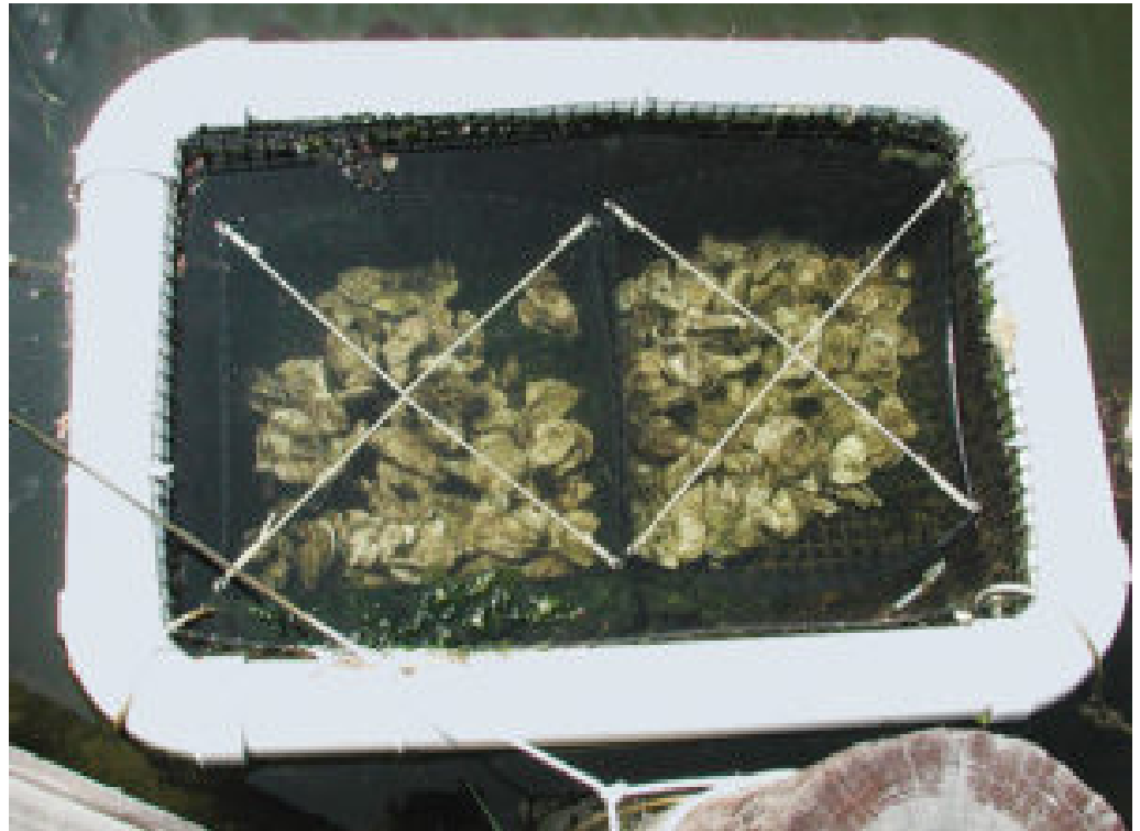
Oysters and oyster shells in the Taylor floats provide cover for juvenile crabs.