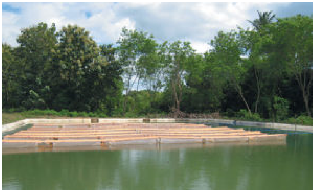
A network of about 30 hatcheries disseminate, GIFT fingerlings to producers.

As a consequence, the project is expected to have positive social and economic impacts on the communities, improving the living standards of poor people and contributing to gender equality via the creation of employment for women in rural areas of Sri Lanka, where the percentage of women involved in the sector is 10 percent.