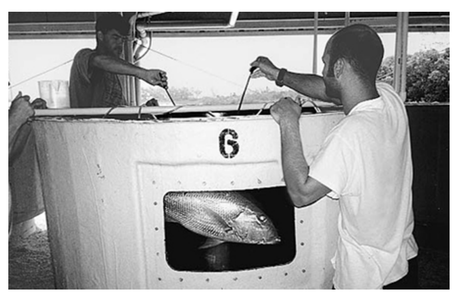
Adult l. analis are held in quarantine tanks and treated for infections and parasitic infestations prior to being stocked in the final maturation system.

Prior to handling, fish should be fully anesthetized using 50 to 200 ppm dilution of 2-Phenoxyethanol. Different species have different reaction times to the anesthetic. Therefore, we recommend starting at the low end of the