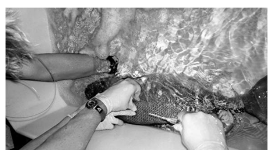
An anesthetized mutton snapper is injected with antibiotics as part of a prophylactic treatment.

Potential ectoparasitic infestations normally found in the skin, gills, and bucco-pharyngeal area should also be treated during the quarantine period. A natural pepper extract commercially available in liquid form has been successfully used to induce detachment of ectoparasites through either a long-term treatment (Check 100 ppm for two h, every other day for a week) or a short-term bath (1,000 ppm or 1 ppt for a maximum of 15 minutes).