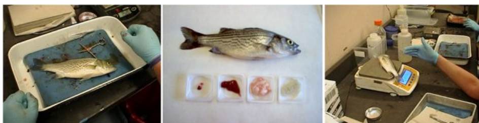
Preparation of fish samples for analysis (left, center), and determination of fish weights (right).

For more detailed procedures on the experimental setup – including laboratory methods, water quality conditions, and statistical analyses – readers are referred to the original publication.