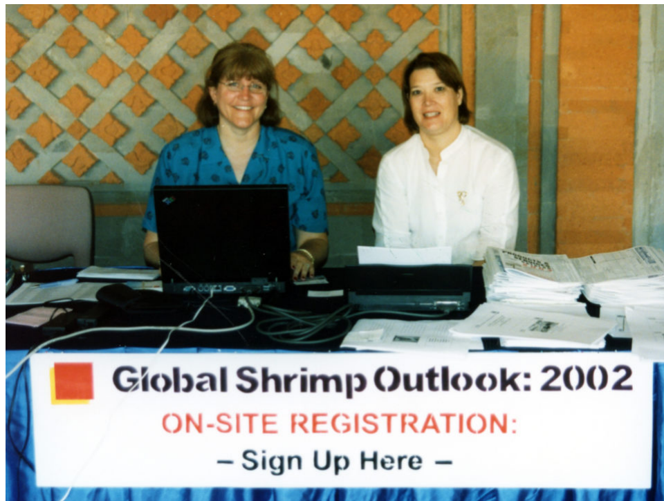
The registration booth at the Global Shrimp Outlook conference in 2002.