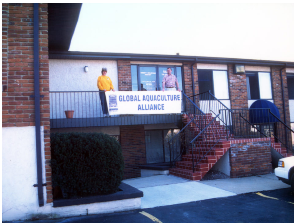
The Global Aquaculture Alliance's first office in St. Louis, Mo., USA.

The Global Aquaculture Alliance ( https://www.aquaculturealliance.org/?hstc=189156916.85fb224b24a9c52b14c7c5c5a52525d5.1684566838617.1684566838617.1&_hssc=189156916.1.1684566838618&_hsf