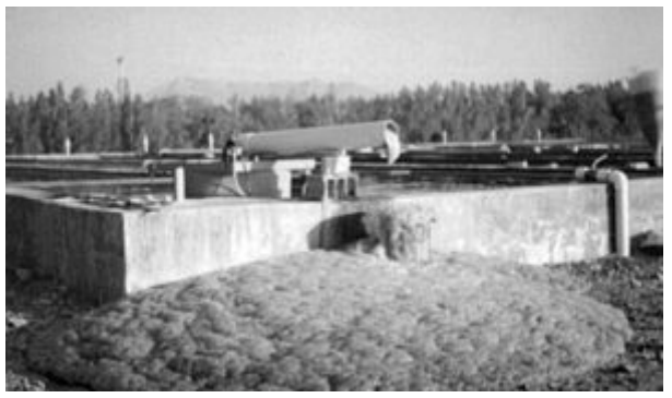
At this zero-exchange tilapia culture operation in Saudi Arabia, dried foam condensate produced by the skimmer is used to fertilize nearby trees.

The SKIM is a new cyclonic counter-current skimmer design developed in the author's laboratory and patented by Ifremer with financial support from the Conseil Régional des Pays de la Loire. It was optimized in cooperation with the Italian company Acqua&Co, a specialist in water aeration for aquaculture.