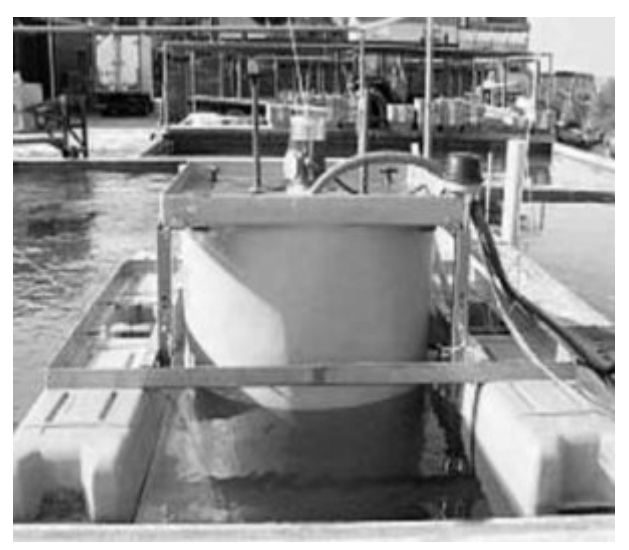
The new floating skimmer in operation during cockle purification experiments conducted by SMIDAP.

A trial was recently carried out at Le Croisic, France, in two 50-cubic-meter concrete tanks by Syndicat Mixte pour le Développement de l'Aquaculture et de la Pêche des Pays de Loire, a regional aquaculture assistance organization in France, to help producers in the depuration of cockles, ( Cerastoderma edule ). The cockles are collected on the seashore in areas contaminated by Escherichia coli .