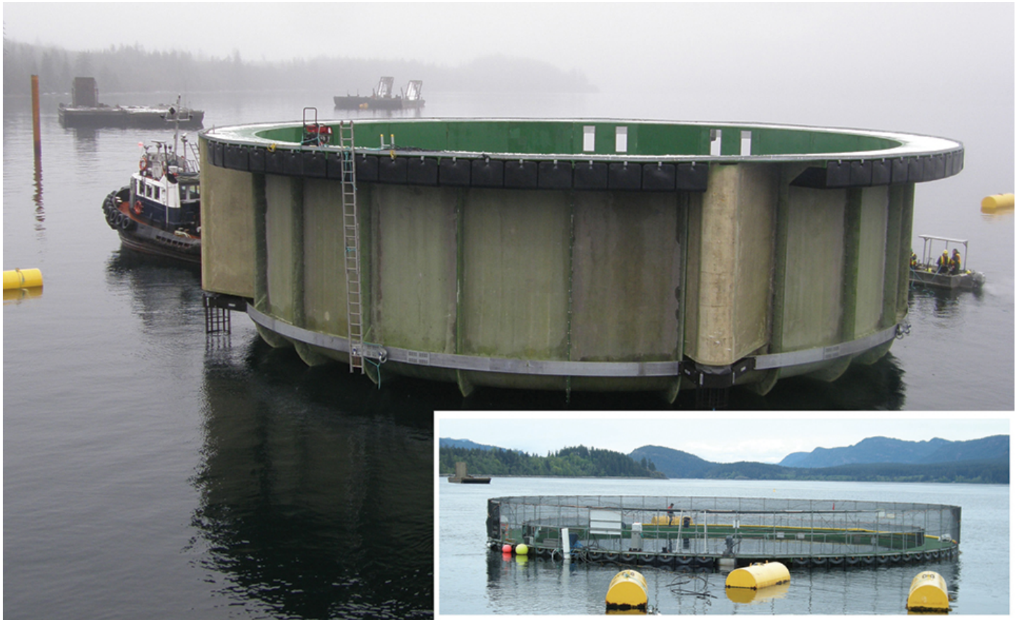
Solid-wall tanks are towed into position and “sunk” to a defined level. Safety and bird protection fence and netting are often added.

In recent decades, seafood production has reached a point of maximum sustainable yield. For many species, including salmon, Atlantic cod and tuna, wild catches have declined due to overfishing and habitat destruction.