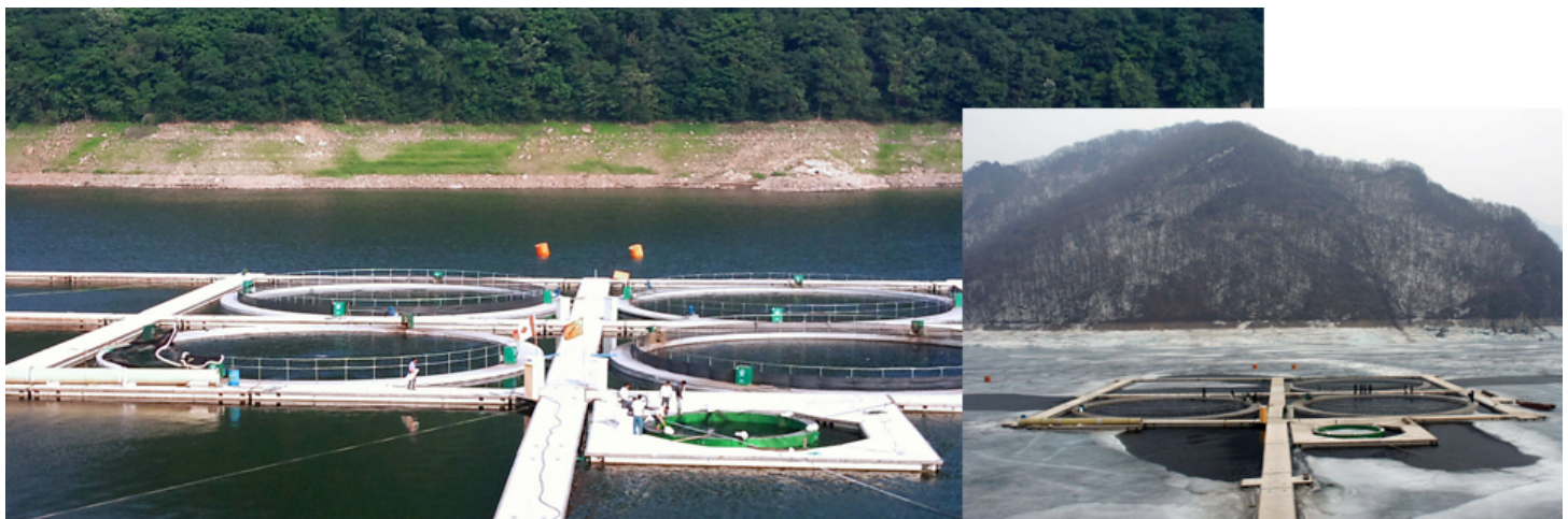
This six-tank facility in China operates summer and winter in a freshwater reservoir. During cold periods, warm water from deep below the tanks is pumped through the tanks so no freezing occurs, and fish growth continues.

Results to date indicate that the composted fish manure is an excellent soil amendment that can provide a useful benefit for crop farmers in neighboring coastal communities. Because of reduced demands on the environment, floating solid-containment farms can be located in a greater variety of locations, including adjacent to transportation hubs and towns where the farm workers live. In fact, reduced transportation time and cost afforded by siting farms close to markets can offset capital costs, so that responsible aquaculture need not always be the more expensive option.