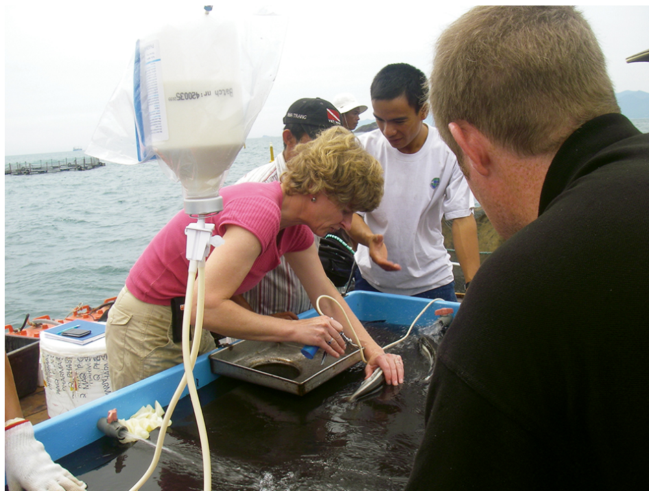
The main author vaccinates cobia at the Marine Farms site north of Nha Trang, Vietnam.

The aquaculture industry is diversifying into new fish species, particularly marine fish. In Norway, for example, four fish species (wolffish, halibut, turbot and cod) are in line for sustainable farming, and Asia has almost 100 fish species under development. Good fish health management will be key to their aquaculture success.