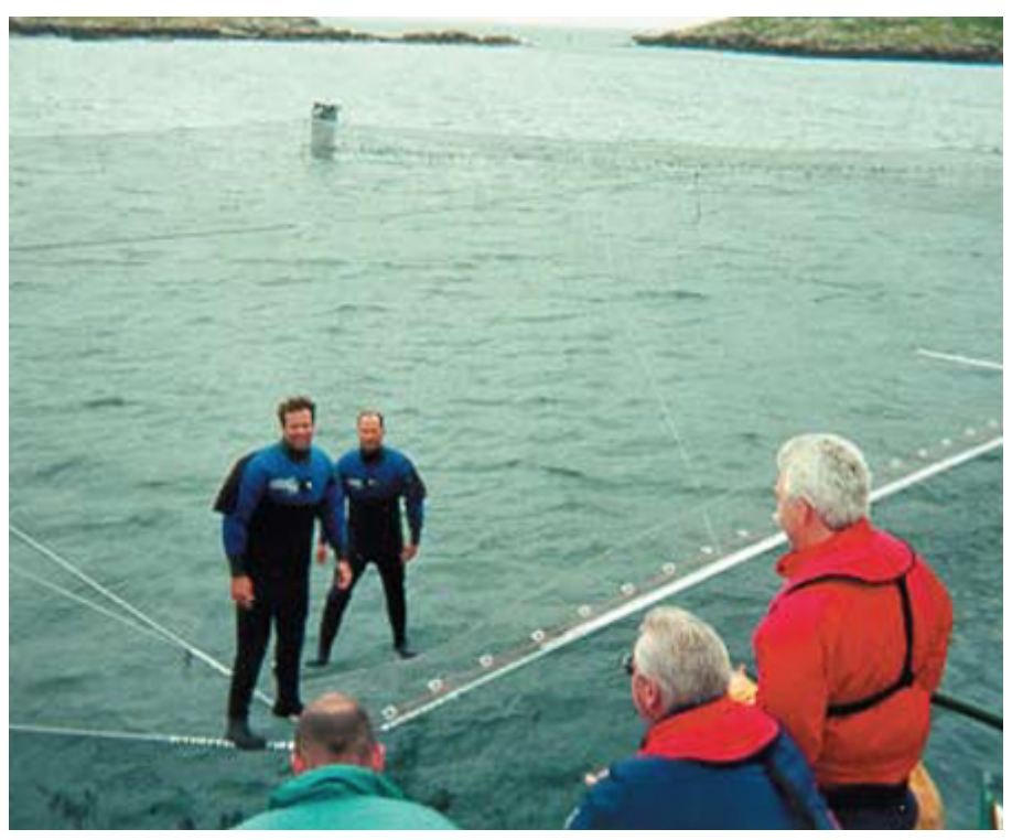
Fig. 1: A single 22,000-cubic-meter Ocean Spar in Killary Bay, Ireland. Installation engineers can be seen standing on the taut top net.