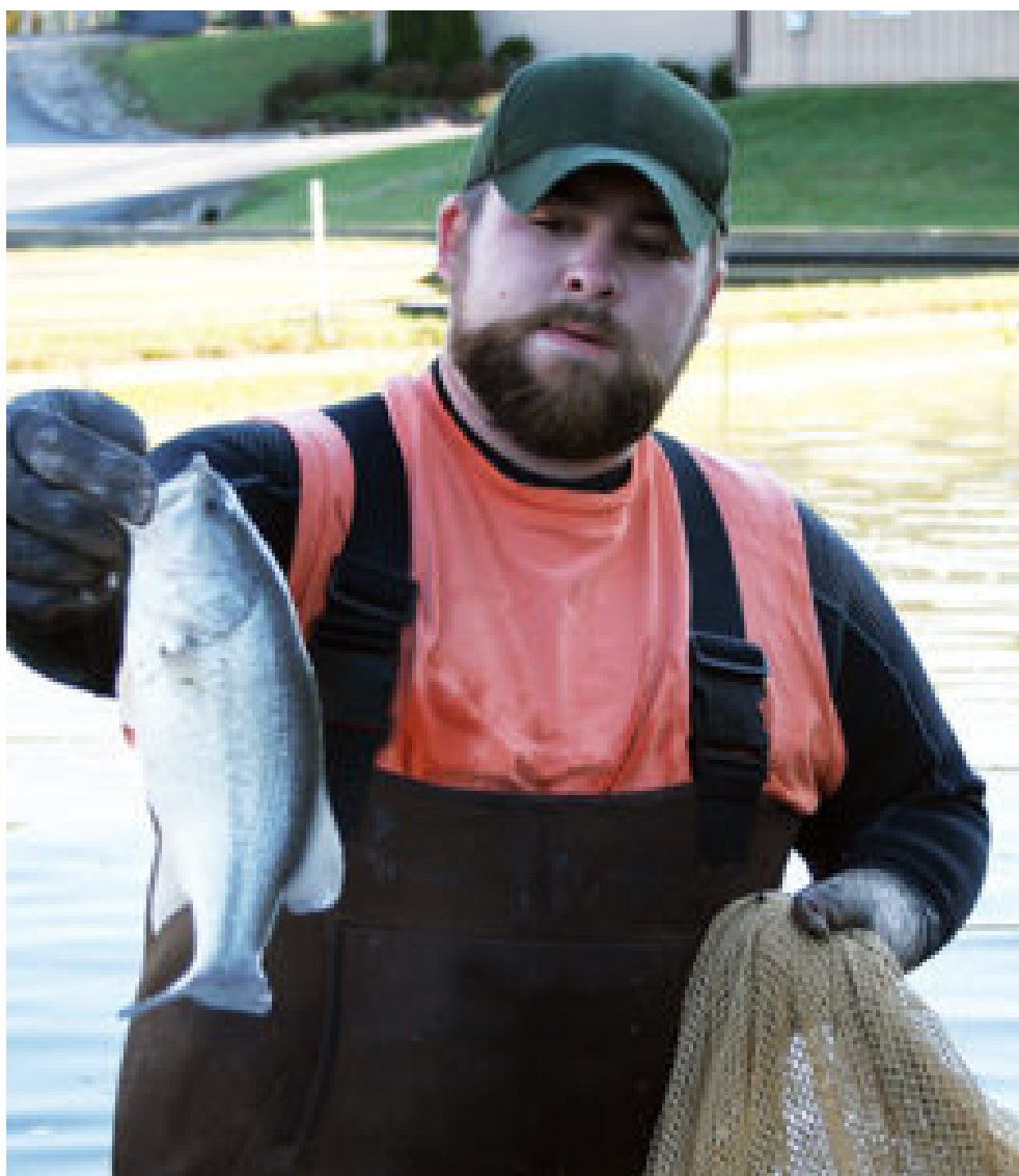
This 0.5-kg bass is ready for the live fish market.

Nesting sites should be prepared with gravel boxes or commercial artificial spawning substrates placed 3 to 6 meters apart at water depths of 0.5 to 1.0 meter, close to the pond bank to allow ease of observation. Spawning ponds are managed for water clarity, as it is important to observe fry activity.