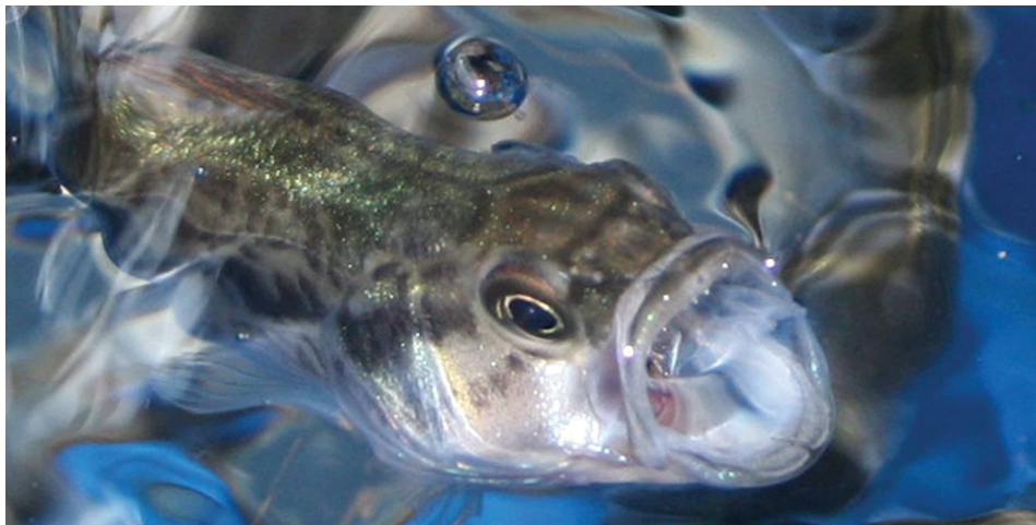
Largemouth bass ( Micropterus salmoides ).