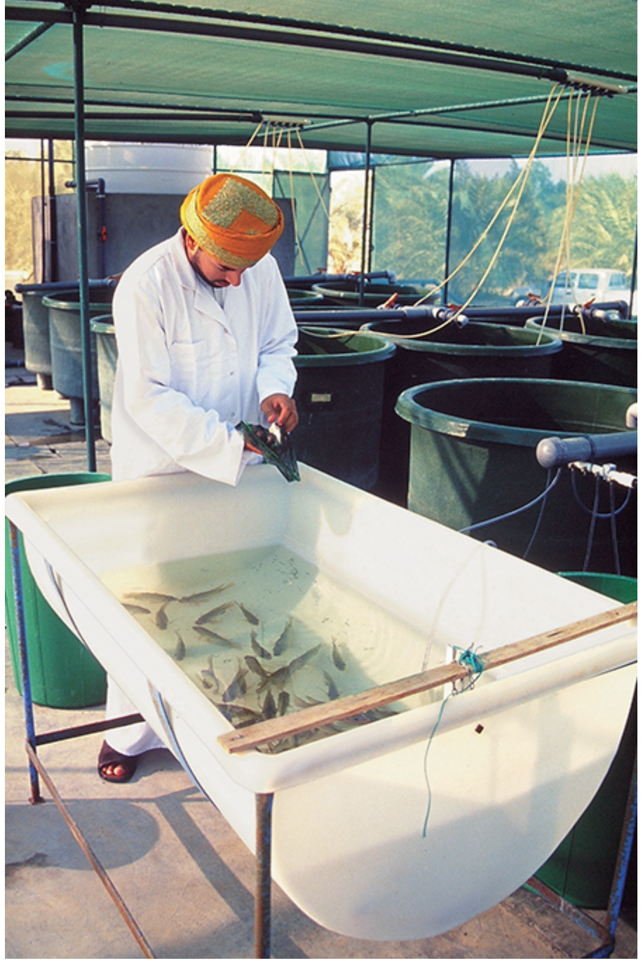
The Agricultural Experiment Station at Sultan Qaboos University is applying modified test methods to evaluate potential ingredients for tilapia feed.

Considerable research has been conducted with tilapia to evaluate cost-effective and regionally available sources of protein for inclusion in tilapia feed. However, fishmeal and soybean meal remain the protein sources of choice for feed manufacturers.