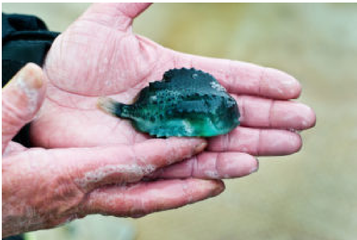
At Marine Harvest sites in Scotland, lumpfish are active in the winter. The cleaner fish make up about 5 percent of the fish in the pens.

"Cleaner fish need looking after as much as salmon. They have to be fed to maintain their welfare, and like to rest at night, so at Wester Ross we have built secure hides for our wrasse to escape to when they are not busy at work," said Bradley.