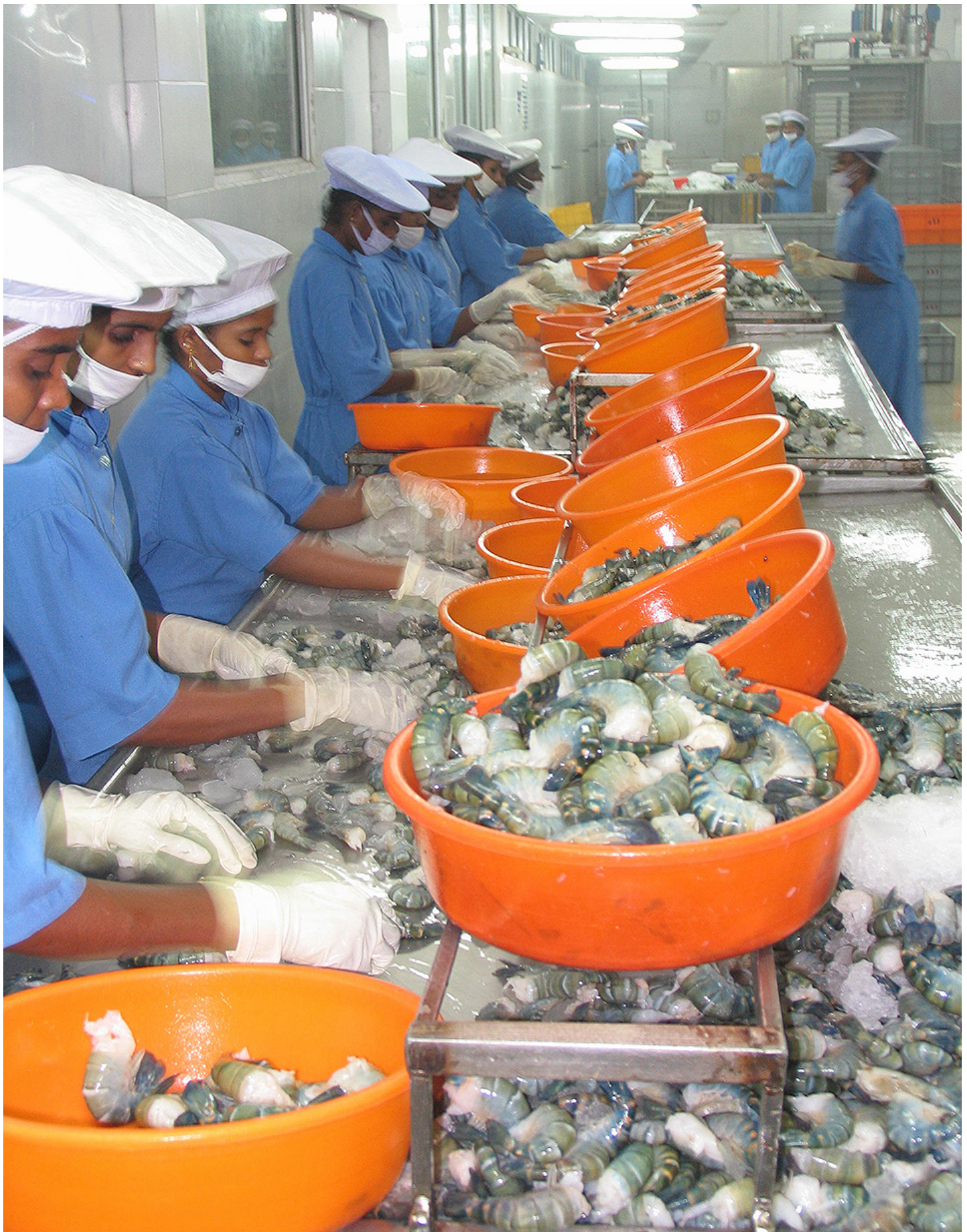
Seafood spoilage can be delayed through the implementation of effective sanitizing, temperature control and other best practices at processing plants.