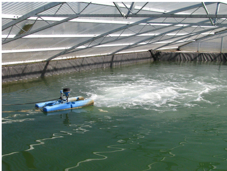
A propeller-aspirator-pump aerator.

There are several types of aerators; different methods of powering aerators; and energy efficiencies of motors, engines and drive trains differ. The experience-based rule for aerator rate mentioned above was developed years ago in Asia for small 1- or 2-hp floating, electric paddlewheel aerators (image 1 below) that were widely used in shrimp ponds and for 1- to 2-hp propeller-aspirator-pump aerators (image 2 below) that also have received appreciable use in shrimp farming. Over the years, shrimp farmers have learned to fabricate and use less expensive, but also less efficient versions of factory-manufactured aerators. A discussion of the factors influencing the efficiency of energy use in shrimp pond aeration is overdue.