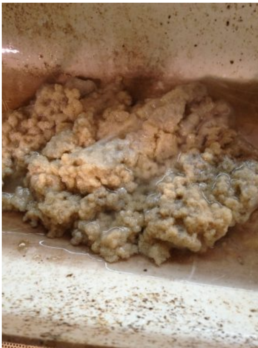
Fungal growth is a significant problem during fish egg incubation.

In our study – here summarized from the original publication ( North American Journal of Aquaculture 78:243–250, 2016) – we carried out an in vitro experiment to determine the concentration of \text{CuSO}_4 that would control fungal growth on culture media followed by an acute toxicity experiment to define the safe and lethal concentrations for sunshine bass larvae. We also conducted an experiment at a commercial sunshine bass hatchery to determine the ideal treatment concentration of \text{CuSO}_4 to control saprolegniasis on sunshine bass eggs.