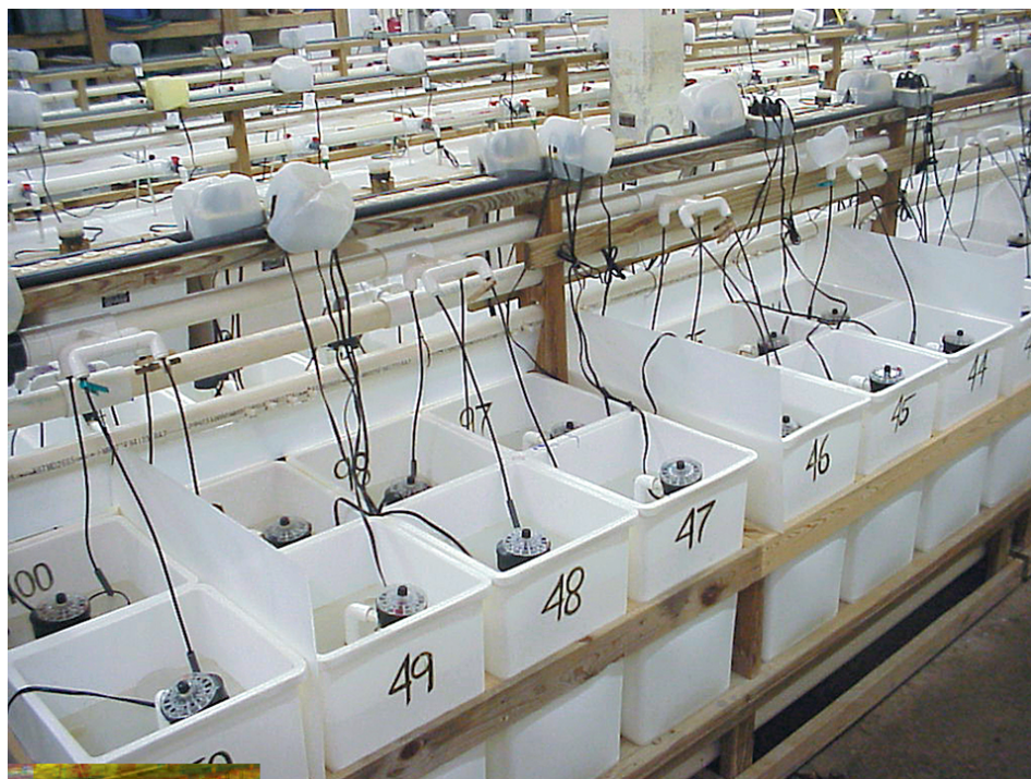
Culture tanks used for sterol growth trial at TAES Shrimp Mariculture Research.

Cholesterol is an essential dietary nutrient in shrimp. Like other crustaceans, shrimp cannot synthesize cholesterol, so dietary cholesterol is necessary for the animals' growth and survival.