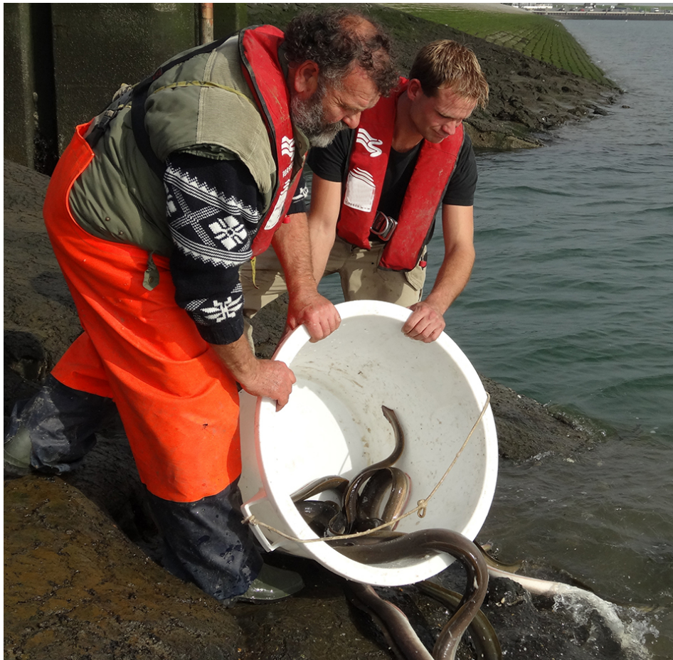
Mature eels are stocked “over the dike” in the sea.

As one of the most technologically advanced forms of aquaculture in the world, eel farming saw an initial rapid growth in production up to the early 2000s. In the past decade, however, the industry has been facing a series of challenges that could damage its future outlook. Farmers are now striving to find new ways to secure the future of European eel production in a more sustainable way.