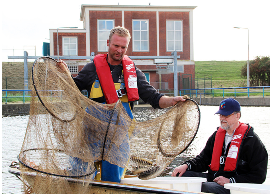
Mature eels are caught in front of a pumping station that blocks their migration to the sea.

To survive, the eel industry has come to the realization that it will have to increase its restocking efforts, either by itself or as part of the national eel plans, and take additional measures to help the recovery of the eels.