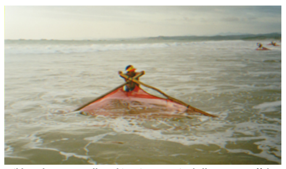
Wild postlarvae are collected in scissor nets in shallow waters off the coast of Ecuador.

Over the past 30 years, Ecuador has developed a large shrimp-farming industry characterized by extensive and semi-intensive production systems. During the 1970s and 1980s, the industry relied almost entirely on wild postlarvae (PL). However, because of the natural variability in the supply of wild PL, a large shrimp hatchery industry also developed in Ecuador.