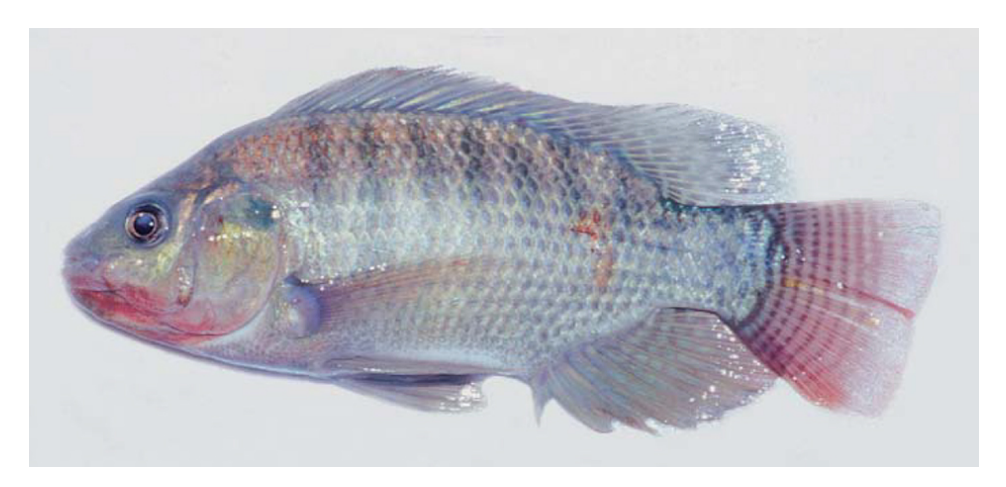
Nile tilapia with bacterial hemorrhagic septicaemia, infected with Streptococcus sp.

Very serious problems associated with the presence of mycobacteriosis have been reported in tilapia in some African countries. To date, however, this infection has only been detected in tilapia cultured in two countries of the Central American and region. In one of these instances, Mycobacterium fortuitum was isolated. Mycobacterium chelonae, M. fortuitum and M. marinum are recognized as potential human pathogens and could be transmitted through the inadequate handling of infected tilapia and/or other infected species of fish (Frerichs, 1993).