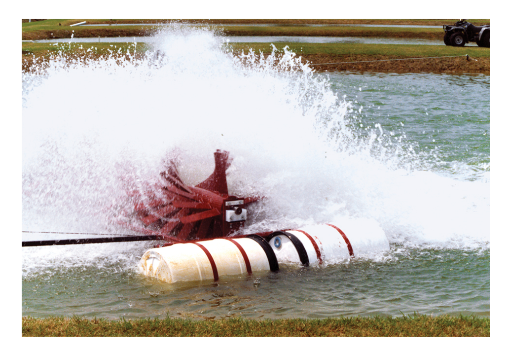
Aeration consumes about 27 percent of the energy used at channel catfish farms.

The main resources for aquaculture are water, land, nutrient sources and energy. There has been much discussion between the aquaculture industry and environmental NGOs about water and land requirements and the use of nutrient sources in shrimp and fish culture. Voluntary best management practice and certification programs stress efficient use of water, land and nutrients. There has, however, been much less dialogue about energy use. Because of the rising cost of fuel, energy conservation will become a critical issue in aquaculture.