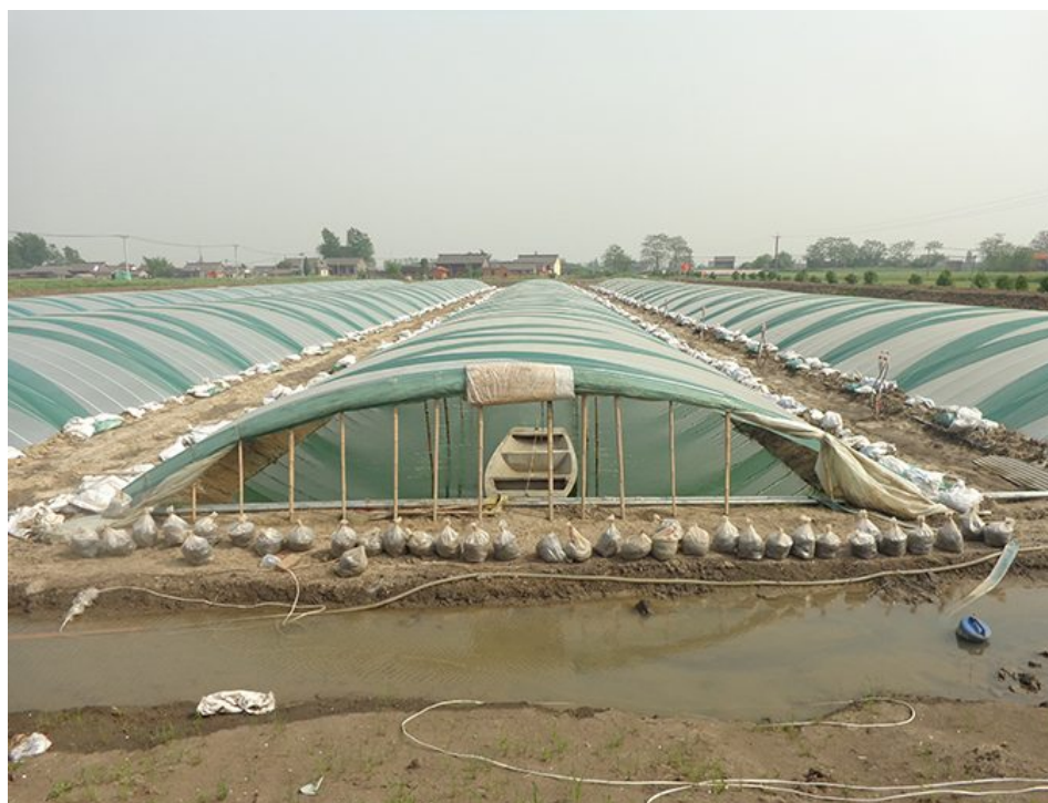
Fig. 2. Common greenhouse used as a nursery pond in Yangtze River Delta.

The nursery systems consist of greenhouses, and heating and aeration equipment. The greenhouse is placed inside rectangular, 300 to 600 square-meter culture ponds depending on the number of total prawn seeds stocked into the culture pond. The main structure of the greenhouses is built with bamboo and galvanized steel pipe bound with iron wire, and serves as the structural support of the greenhouse. This structure is covered with a layer of transparent plastic film, tied down and kept in place using ropes. Greenhouses are set up usually about one month ahead of the stocking time for the young prawn postlarvae.