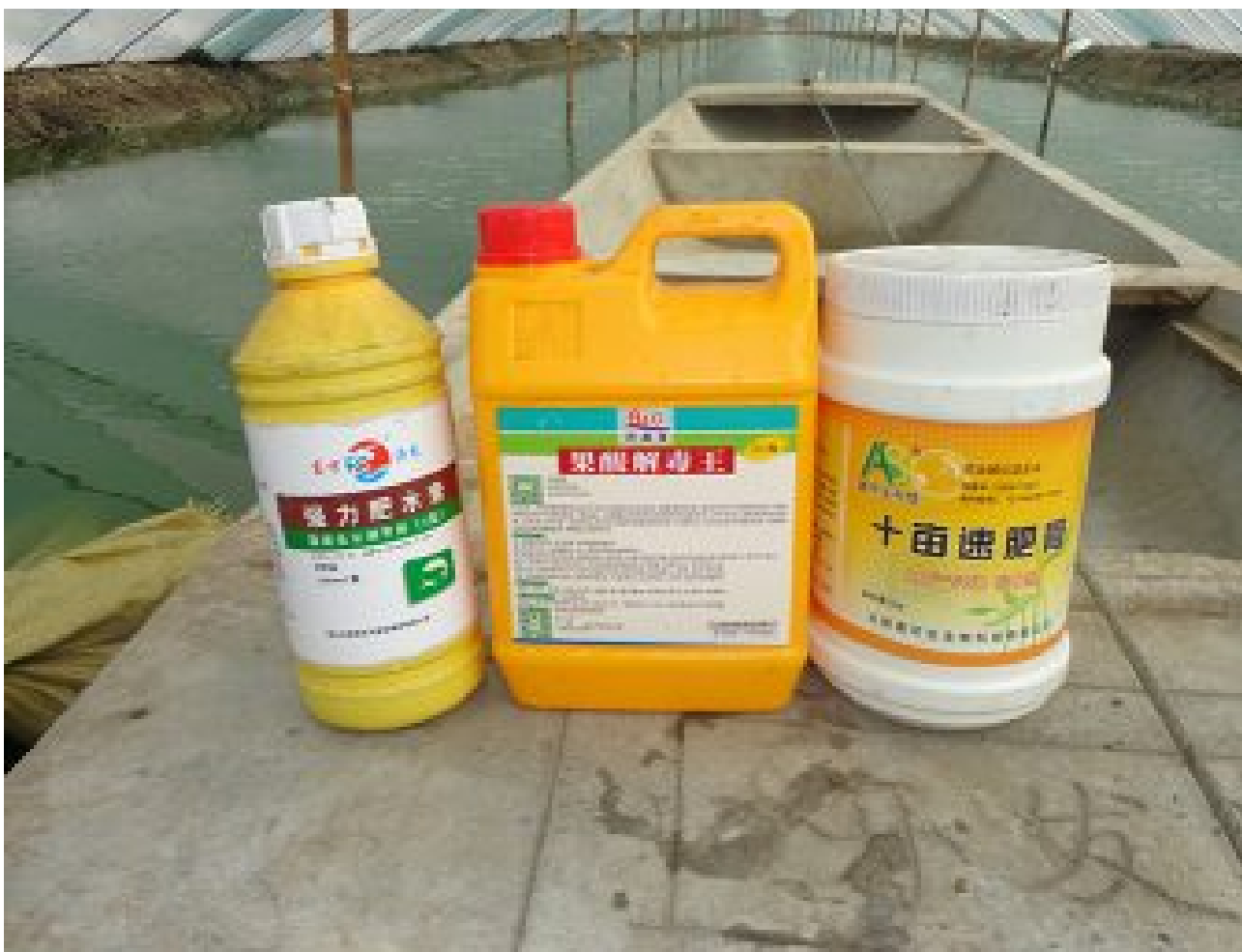
Fig. 3. Liquid fertilizers and commercial microbial probiotics used during the prawn nursery period.

stocking density of prawn postlarvae is high during the nursery period. Poor water quality often results in low survival rates in the nursery ponds, so water quality plays an important role in this phase. The use of probiotics during the nursery period is widely implemented by the local prawn farmers. Before stocking, the nursery ponds are filled with freshwater pumped from the nearby river. Most farmers use probiotics, reportedly as algae growth regulators to stimulate an initial algae bloom, then use other probiotics to improve water quality and stimulate the immunity of the postlarvae. The use of probiotics can increase prawn survival and growth in the nursery phase, and the use of liquid fertilizers and commercial microbial probiotics is very popular among local prawn farmers. Pond water is partially exchanged during the nursery period, depending on water quality.