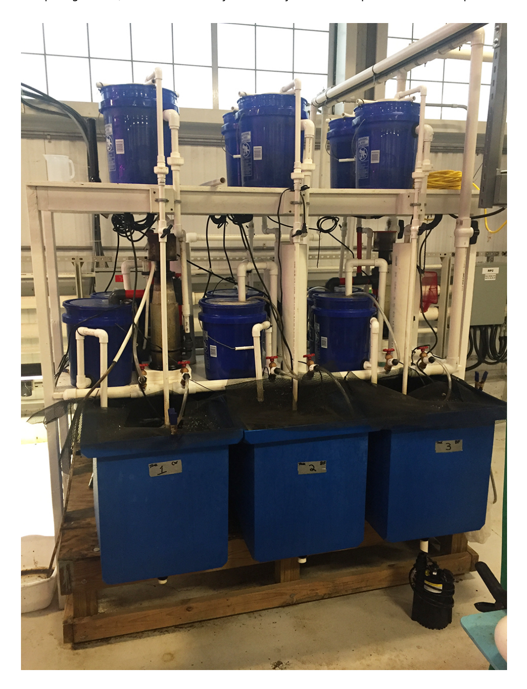
View of the experimental system used in this study.

Tilapia fry (mean initial weight of 0.17 grams) produced from YY males sourced from Louisiana Specialty Aquafarm (Robert, Louisiana, USA) were stocked at 55 fish per tank (305 fish per cubic meter). During the experiment, the fish were fed commercial crumble feeds (55 percent crude protein, 15 to 17 percent crude fat) from Zeigler Bros., Inc. (Gardners, Pa., USA), and Rangen Inc. (Buhl, Idaho, USA). Feeding rations started at 10 percent of fish weight per day and gradually decreased to 5 percent per day. All tanks were fed the same amount, regardless of treatment, and feed was provided at evenly spaced intervals three times per day.