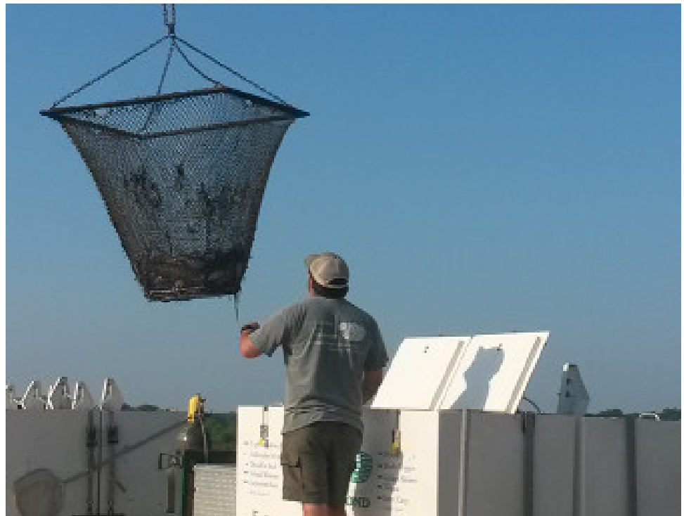
Hybrid catfish being loaded out for stocking of private ponds and lakes.