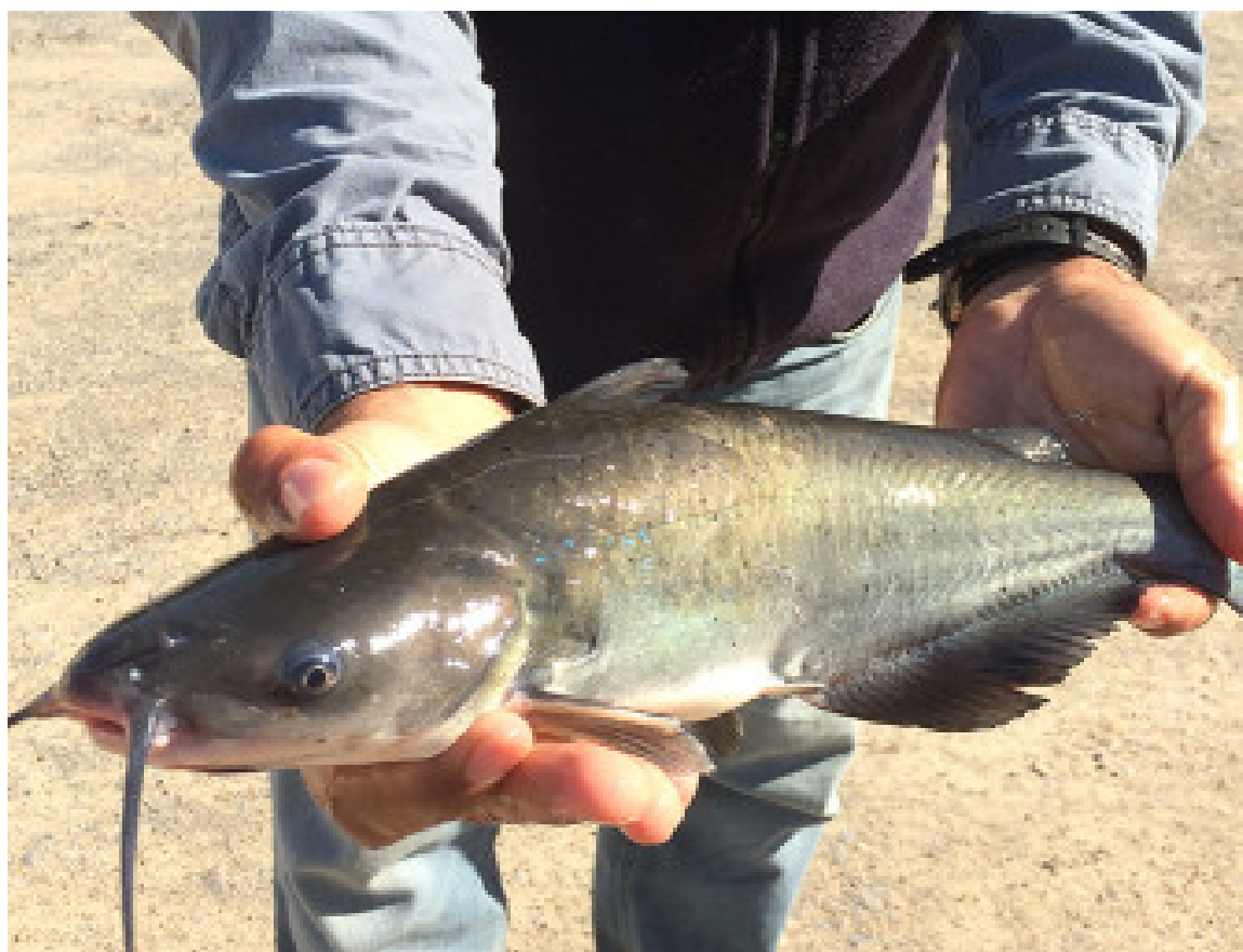
Hybrid catfish have been raised in an in-pond raceway system to supply niche markets.

The design of the IPRS makes harvest of small amounts of fish (<450 kg weekly) feasible from the standpoint of labor, time, and cost. Since fish are confined to raceway cells that are easily crowded and harvested, a significant reduction in labor cost has occurred compared to harvesting larger traditional levee ponds. This has made it economically feasible to