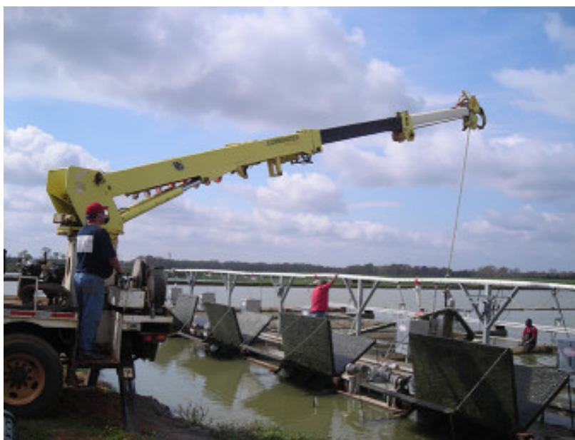
Partial harvest of an in-pond raceway in Browns, Alabama.

stocking densities of the raceways. Fish were fed a commercial, floating feed (32 percent protein, Alabama Feed Mill, Uniontown, Ala., USA) 2 – 4 times per day based on biomass, water temperature, and fish size. Catfish were harvested throughout the study as they reached marketable size (Fig. 3 & Fig. 4). Due to the ease of harvest, a range of sizes were sold based on customer demands.