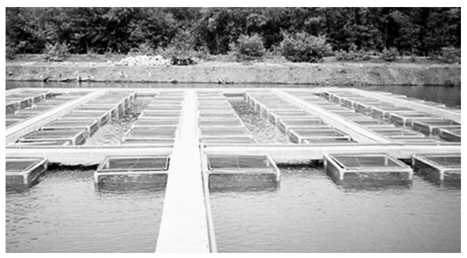
Fig. 1: The growth trial was conducted using bottomless cages in a single 0.32-ha pond.

Variability in the severity of white spot syndrome virus outbreaks can be correlated to seasonal and environmental factors, suggesting an interaction between the disease and stress factors. In some cases, shrimp survive exposure to WSSV, but the presence of additional stress factors can cause an acute outbreak of the disease.