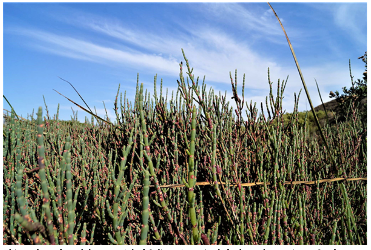
This study evaluated the potential of Salicornia neei , a halophyte plant native to South America, to treat saline effluents with simulated concentrations of ammonium-nitrogen and nitrate-nitrogen in a comparable manner to land-based marine aquaculture effluents.