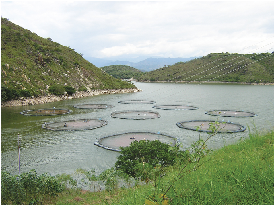
The size and scale of cage structures are defined by water velocity, stocking density and other factors.

Water quality in cage culture depends largely on the basic physical, chemical and biological characteristics of the water body and the particular site where cages are installed. Feed is applied for fish in cages, and uneaten feed and fish feces fall through the cage netting. Fish remove dissolved oxygen from water in cages for respiration and excrete carbon dioxide, ammonia and other soluble wastes back into this water.