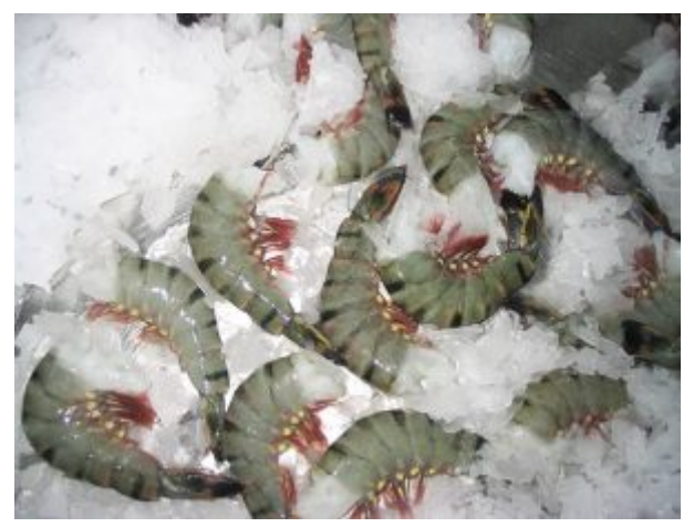
Proper temperature control of harvested shrimp is critical for product wholesomeness and quality.

During freezing and deep freezing, the water in the product solidifies to ice. At temperatures below -18 degrees-C, development of all microorganisms and biochemical changes are stopped, which results in frozen products having shelf lives from several months to more than one year. The quality of the product depends on the quickness to lower the temperature of the product to any point below -18 degrees-C, to crystallize all the water contained in the product.