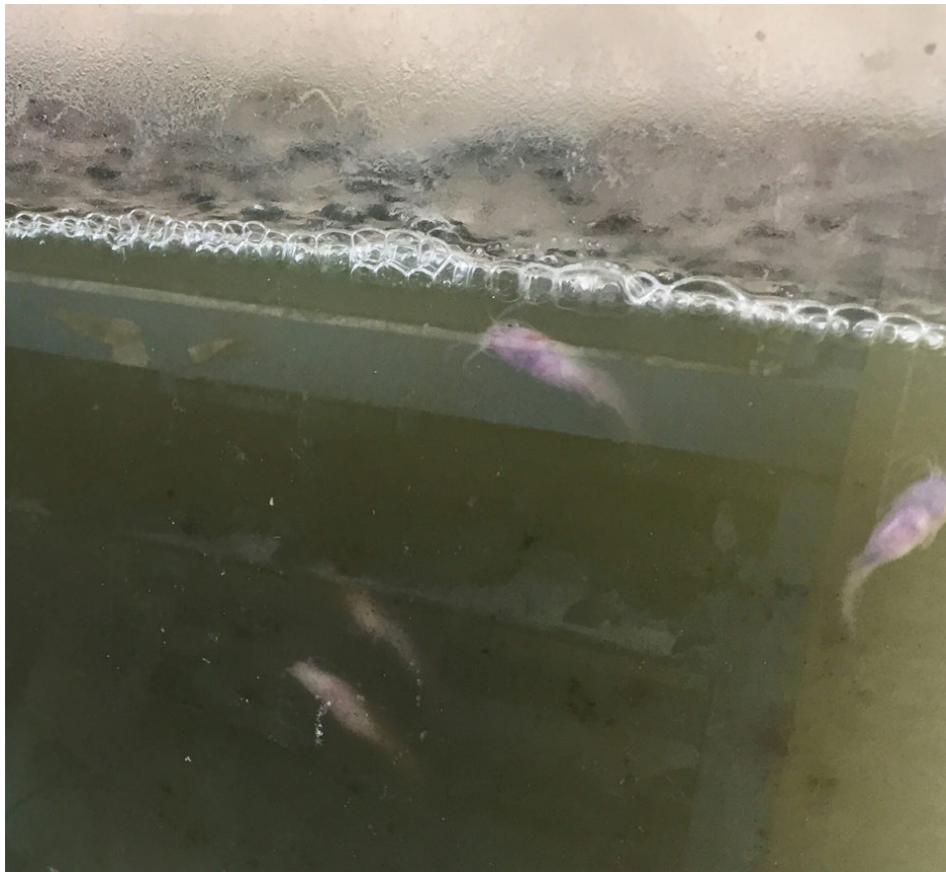
African catfish juveniles actively swimming in an outdoor biofloc-based system at Universiti Putra Malaysia.

Biofloc technology is a water quality management strategy that requires adding a carbon source – such as sugars, glycerol or complex carbohydrates – that stimulates heterotrophic bacterial growth, which converts otherwise toxic nitrogenous waste into biomass.