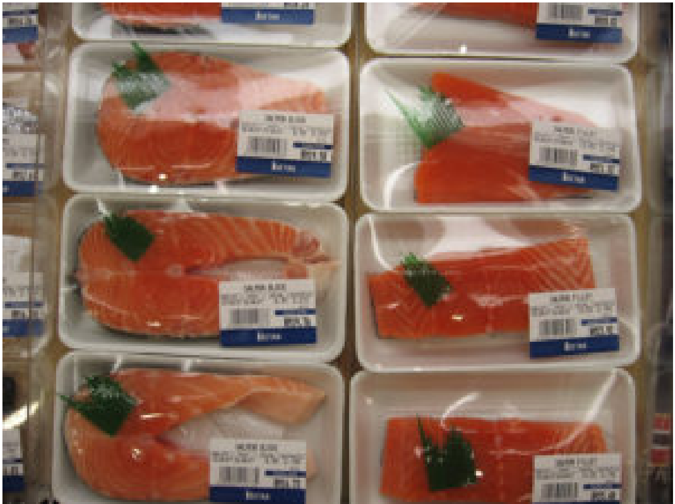
Processed salmon steaks and fillets, with packaging that includes barcode labels, at a supermarket in Asia.

visible phenotypic variation during their development, making recognition and classification burdensome and error-prone, leading to a variety of taxonomic and aquaculture problems.