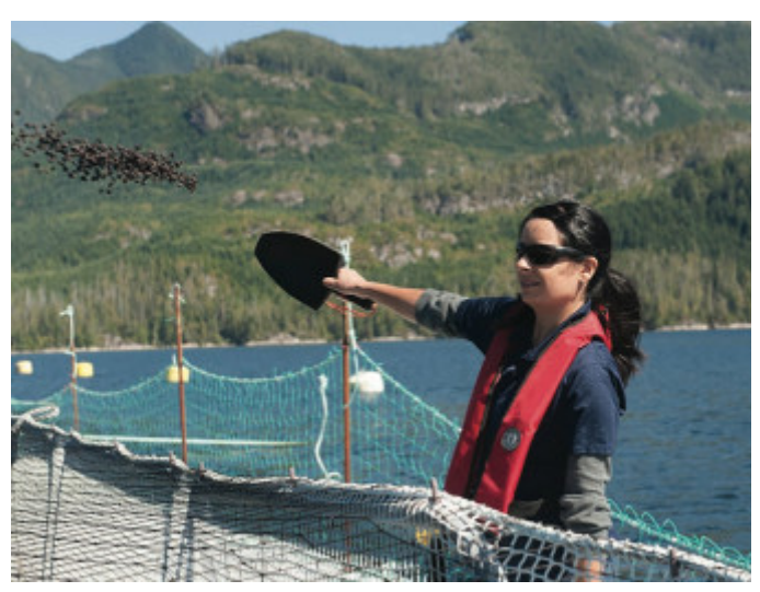
British Columbia's salmon farming industry's forage fish dependence ratio (FFDR) has decreased from 7.2 kg to 1.5 kg (per kilogram of farmed salmon) for fish oil and from 4.4 kg to 0.23 kg for fishmeal.

According to the report, B.C. salmon farmers produce approximately 71,500 metric tons (MT) of fish annually; Atlantic salmon comprises 94 percent of the total, with chinook, coho and steelhead accounting for the remainder. Production has been consistent over the past decade, the group said.