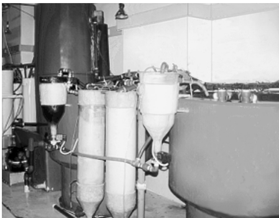
View of a computer-based feeding system in a larval-rearing unit.

Total larvae length, mortality rate, and the amount of food delivered were chosen as the main linguistic variables describing the system, together with a variable describing zooplankton availability to the larvae. The controlled variable defines the changes that should be applied to the food quantity.