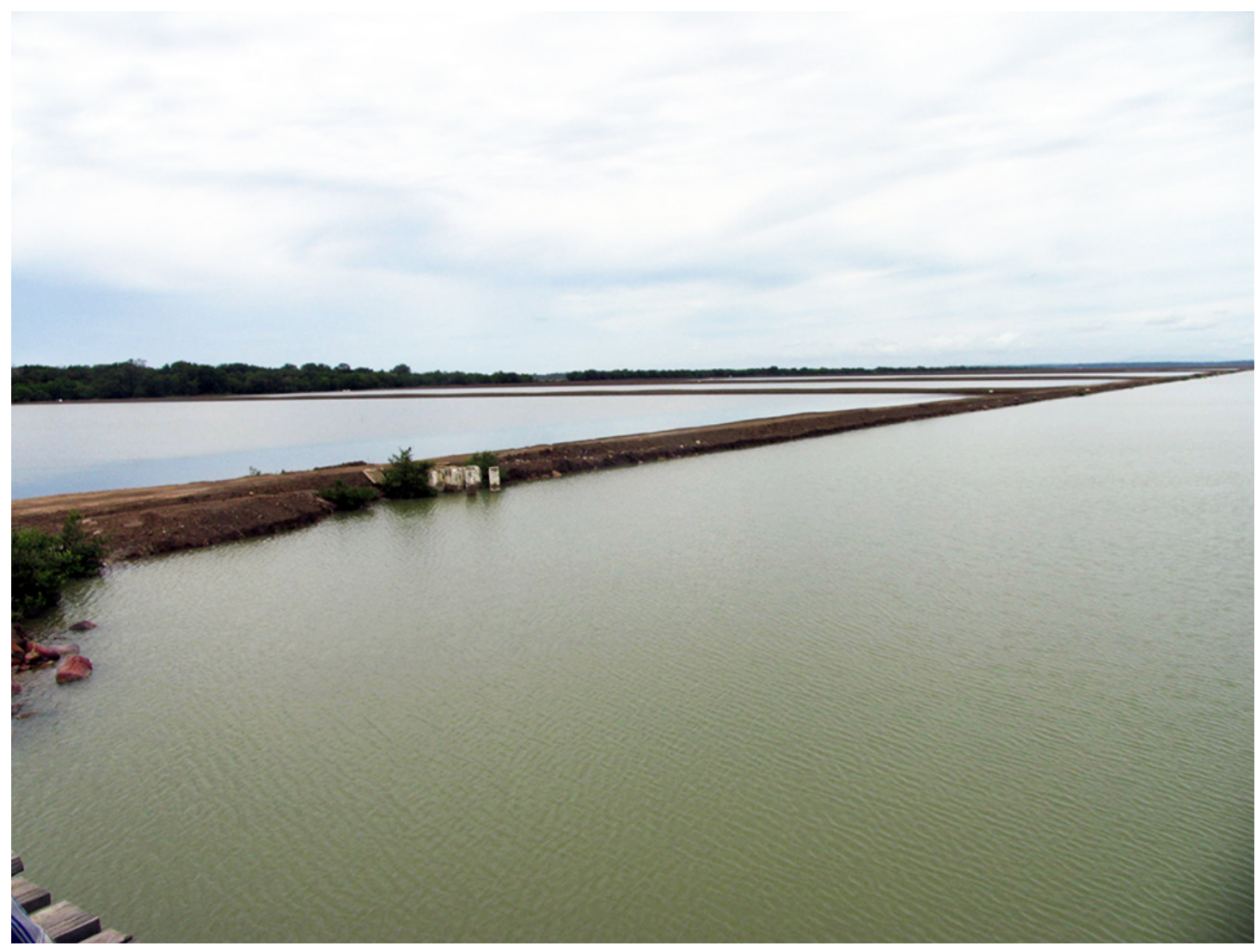
Pollution factors such as acid rain and higher atmospheric carbon dioxide concentration are leading to reduced pH levels in surface and ocean waters, which negatively affects fish and shellfish.

Acid-base relationships are important in aquaculture water quality, because they influence pH and concentrations of carbon dioxide and alkalinity. As a general rule, most types of aquaculture can be conducted best in waters that are slightly basic with pH of 7.5 to 8.5. In ponds, waters should have sufficient total alkalinity to buffer against pH change during periods of rapid phytoplankton photosynthesis.