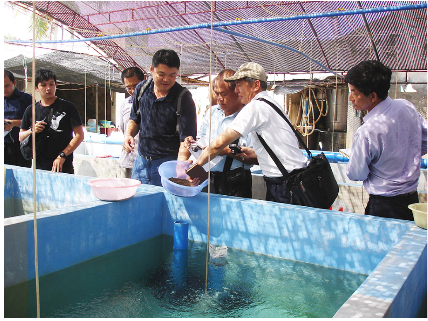
ASAIM helped bring staff from marine hatcheries in Southeast Asia to visit and learn from hatchery operations in China.

As the world's demand for high-quality seafood products continues to rise, future increases in production are unlikely to come from wild sources, and traditional aquaculture-producing areas will be strained to compensate. In China, for example, seafood demand is increasing, but the country is seeing a decrease in culture areas for marine fish, with desired coastal areas for pond and cage farming being taken away in favor of residential and tourism development.