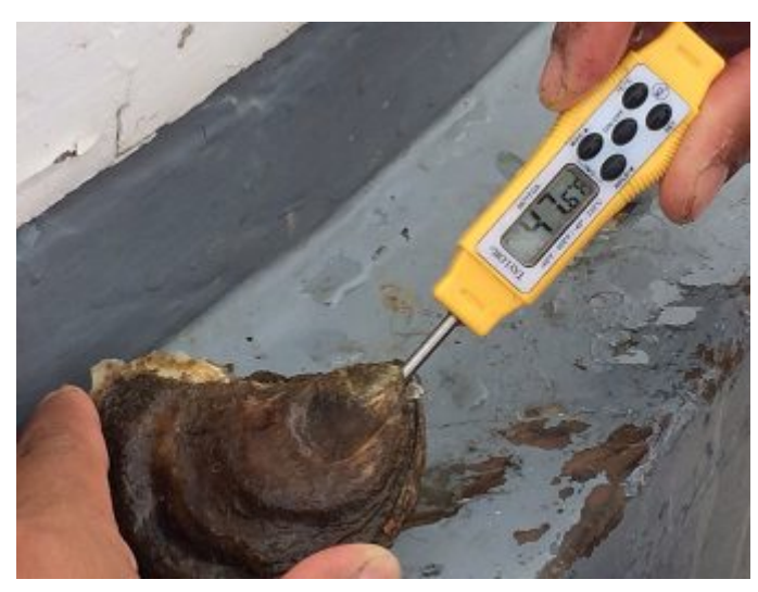
New harvesting protocols for many oyster harvesters include immediately reducing the

All public health laboratories are now asked to forward every isolate of vibrio species they receive to the <u>CDC</u>, <u>where they're tested</u> to for antimicrobial resistance.