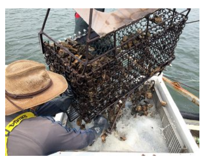
After a vibrio outbreak in 2013, Norm Bloom & Son Copps Island Oysters started using an icing slurry, dropping the oysters into the chilled water

That outbreak spurred concerns the O4:K12 strain was possibly becoming endemic on the Atlantic coast, and prompted new state requirements on how oysters were to be handled post-harvest.