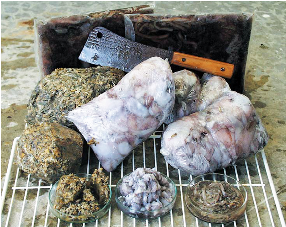
Fig. 2: Frozen fresh food, e.g. mussel, squid and bloodworm, are chopped into pieces and fed to the shrimp broodstock.