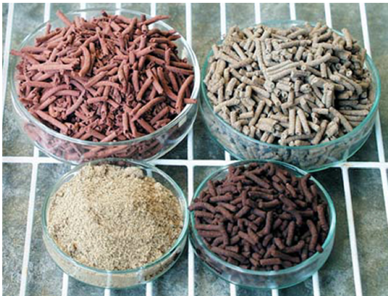
Fig. 3: Dry artificial diets, available commercially as pellets or powders, are generally not used in ratios higher than 25 percent of the total feeding regime.

to accept moist diets easier than dry diets.