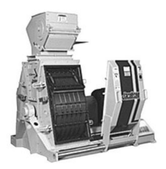
Fig. 2: Hammermill.

Hammermills (Fig. 2) have long being used for particle reduction in the animal feed industry. A hammermill unit consists of a rotor assembly with two or more rotor plates fixed to a main shaft. The actual working parts are the hammers and the screen. Size reduction in a hammermill is the result of impact between the rapidly moving hammer and the incoming material.