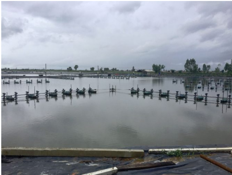
View of a grow-out shrimp pond implementing the Aquamimicry production approach.

The prevalence of numerous diseases that affect the shrimp and prawn aquaculture industry has promoted the development of various health management strategies. Some include greater biosecurity and sourcing of specific pathogen-free animals, and in more extreme cases, using chemicals and antibiotics.