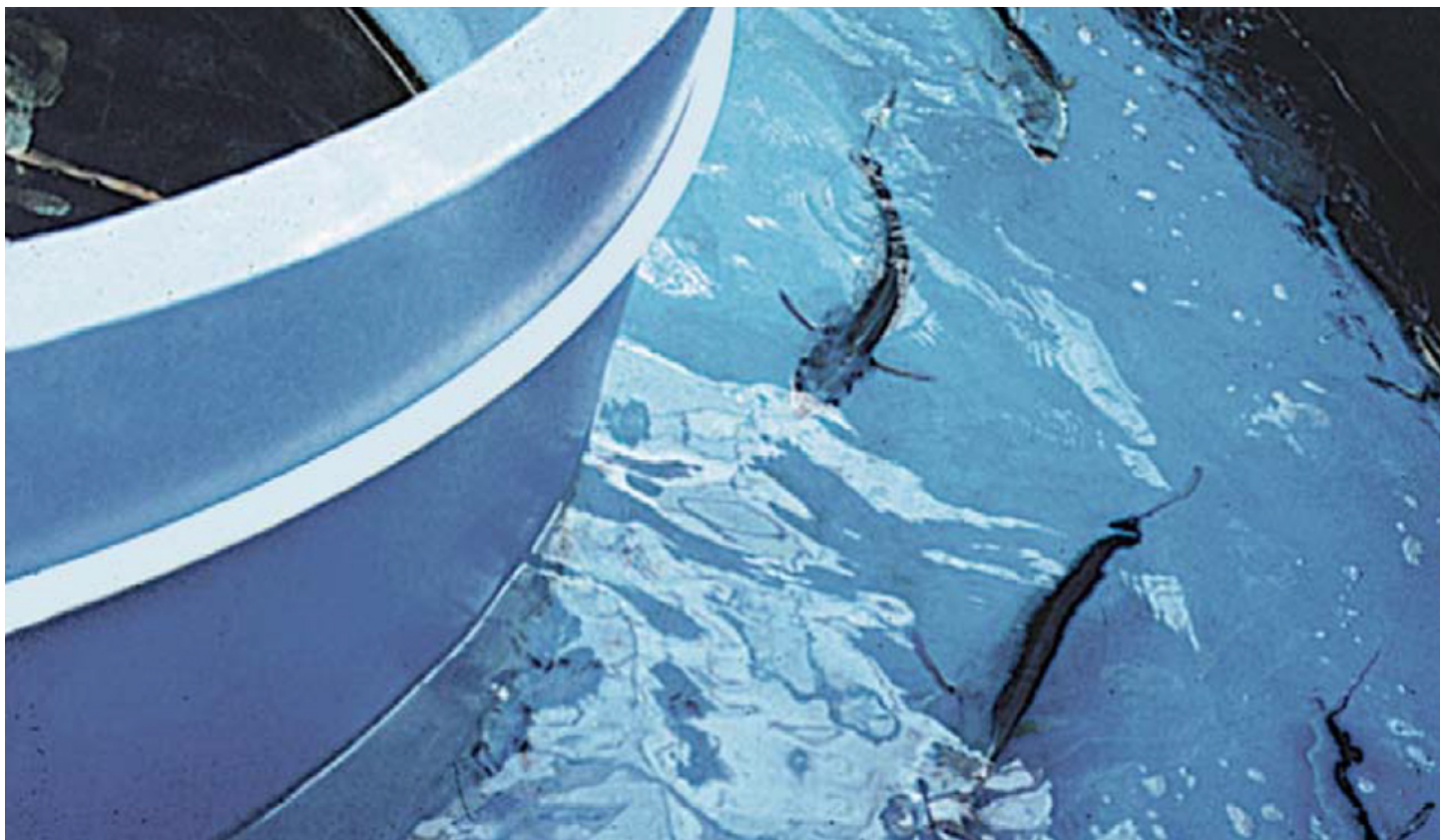
Mahi mahi broodstock kept in captivity can spawn naturally year-round. These healthy broodfish at the Waikiki Aquarium in Hawaii, USA produced viable eggs for long periods of time.

The mahi mahi, also commonly known as dolphin fish and dorado ( Coryphaena hippurus ), has long been recognized as a high-value pelagic fish with excellent potential for aquaculture. Indeed, several researchers have demonstrated the technological feasibility of mahi mahi aquaculture since the early 1970s.