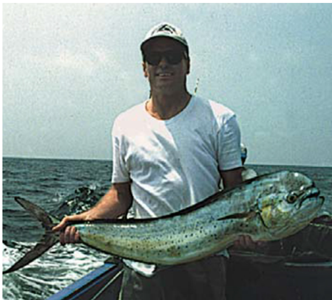
The author holds a deeply anesthetized broodstock mahimahi during transportation.

Overall survival rates from egg to market size remain below 10 percent, and represent one of the main hurdles for commercial aquaculture development. Mortalities due to uncertain causes are common at various developmental stages (e.g., first feeding and metamorphosis) in artificial environments. Also, combative behavior among juvenile cultured dolphin fish results in significant mortalities from cannibalism and stress problems.