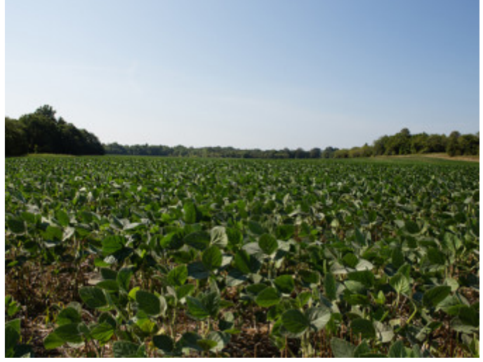
A typical U.S. soybean field.

rest of Asia, that's very, very small. However, being close to the Vietnam border, and on the Mekong, they should have opportunities for increased production. They will certainly need more fish in the future.