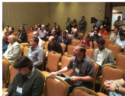
All sessions were well attended.