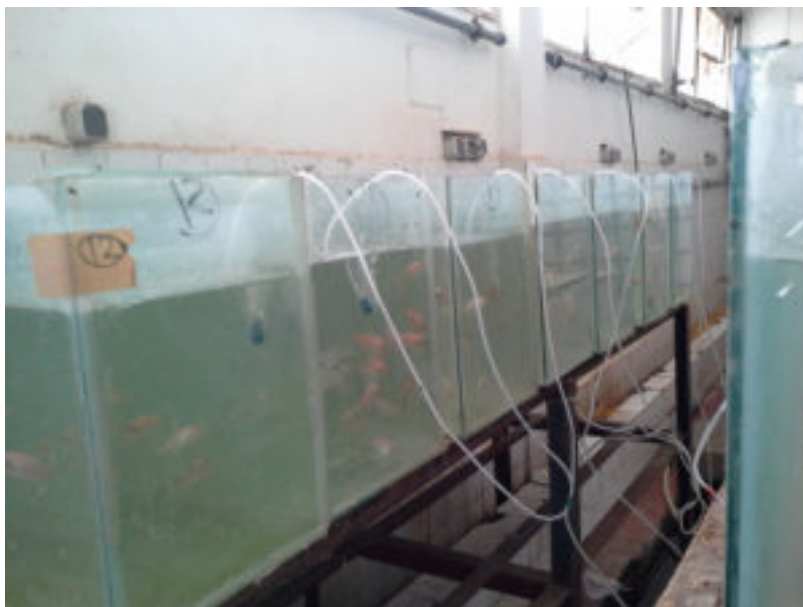
Laboratory setup keeps separate strains in different tanks.