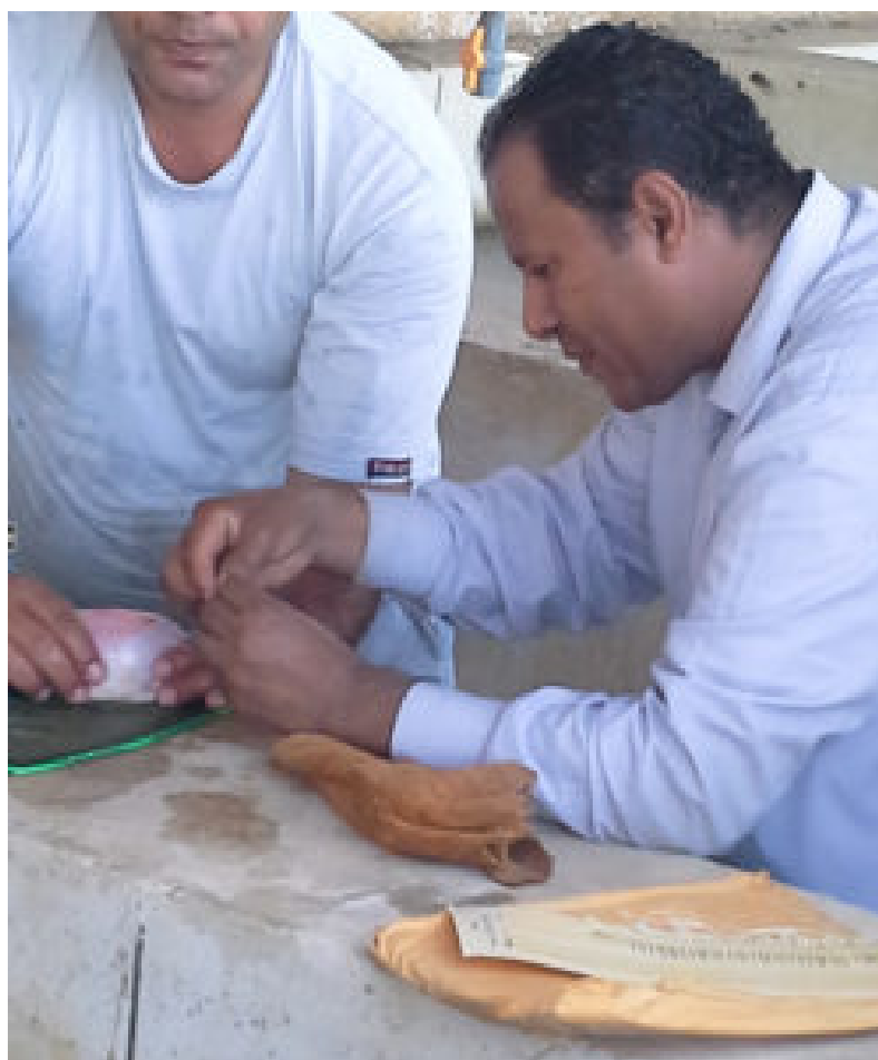
Author examining fish during selective breeding program.

improvements in aquaculture production in Africa can be achieved through similar selection programs for faster growing fish in the region.