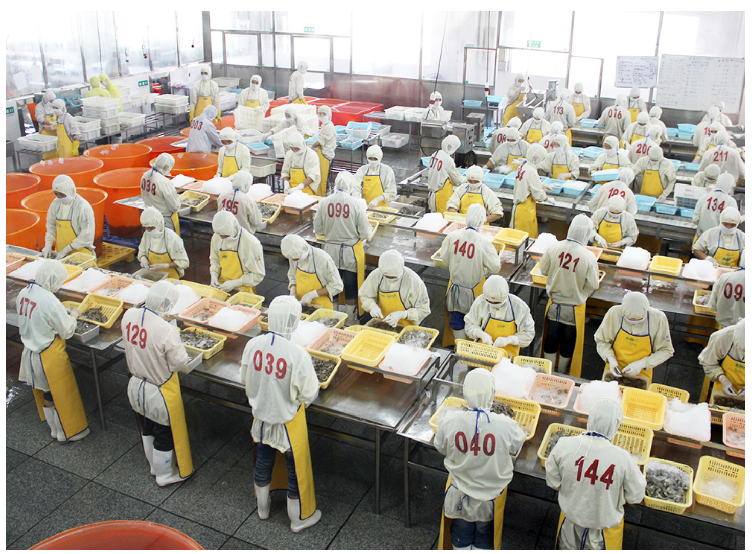
It is very difficult to determine the amount of antibiotic resistance that passes through the food chain. Due to the delay between food exposure and infection, linking human infections to resistant bacteria in foods based on animals treated with antibiotics is challenging.

The development and spread of antimicrobial resistance genes into human pathogens as a consequence of exposure to antibiotics in aquaculture is widely documented. For example, multi-resistance plasmids have been shown to be transferable to Escherichia coli from Aeromonas salmonicida , Aeromonas hydrophila , Edwardsiella tarda , Citrobacter freundii , Photobacterium damselae subsp. Piscicida , Vibrio anquillarum and Vibrio salmonicida .