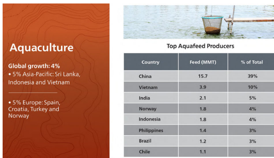
Fig. 2: Top aquafeed producing countries.

aquaculture feed production, most likely due to their volatile economies at present. The biggest producer of the region, Brazil, did see a growth of 4 percent feed production and the second highest, Chile, remained flat.