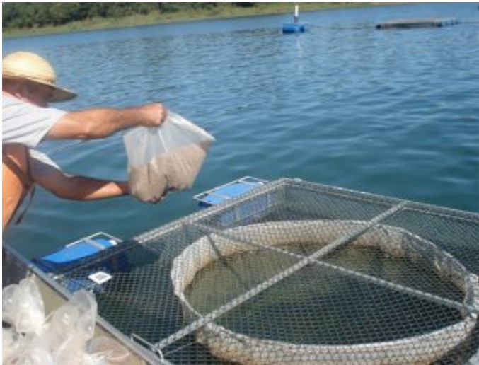
Feeding the tilapia during the trial.

The feed was prepared in a commercial extrusion feed line, and the additive was added in the mixer with the rest of the ingredients prior to cooking-extrusion. The animals were fed four times per day until they reached 170 g, and once the trial started, animals were fed three times per day. Any non-consumed feed was recovered and counted. No differences in terms of appetite were detected during the trial due to feed type. At the end of the trial, all fish were harvested, counted and weighed, and 5 percent of the animals in each treatment were checked and evaluated for their viscero-somatic indexes.