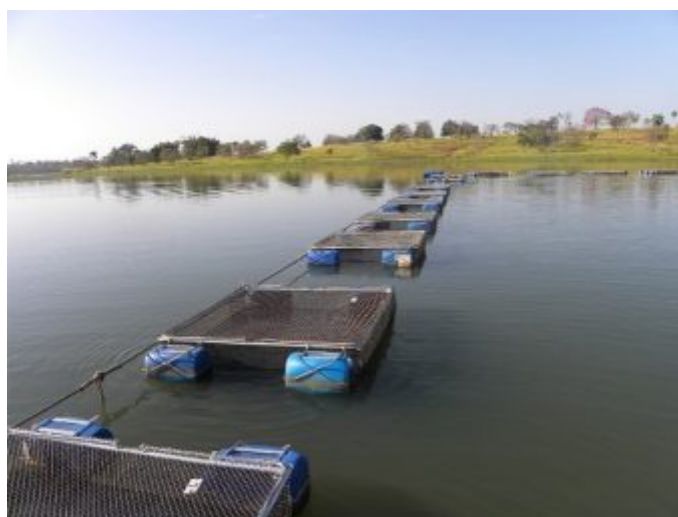
View of the tilapia cages used in the study.

2011; Tzouramanis et al. 2012; Valle et al., 2015). In this study, we evaluated the effect of a gut health promoting additive on the production parameters of tilapia reared in cages in Brazil.